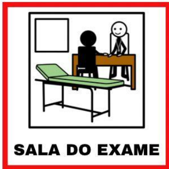
SALA DO EXAME