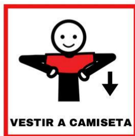
VESTIR A CAMISETA