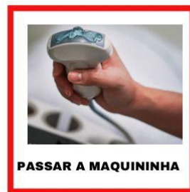
PASSAR A MAQUININHA